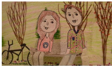
Saved from carbon dioxide - saved our planet as we know it.