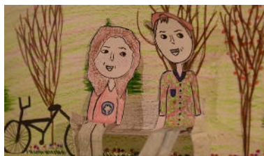
Saved from carbon dioxide - saved our planet as we know it.